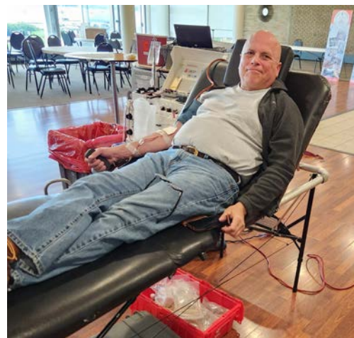
May Blood Drive