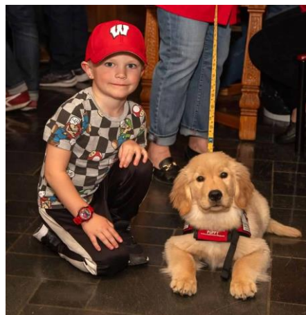
Spaghetti Dinner 2024: lots of fun and fun!