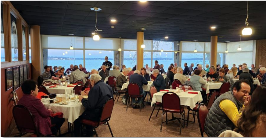
Friday night fish fry at the Lodge.