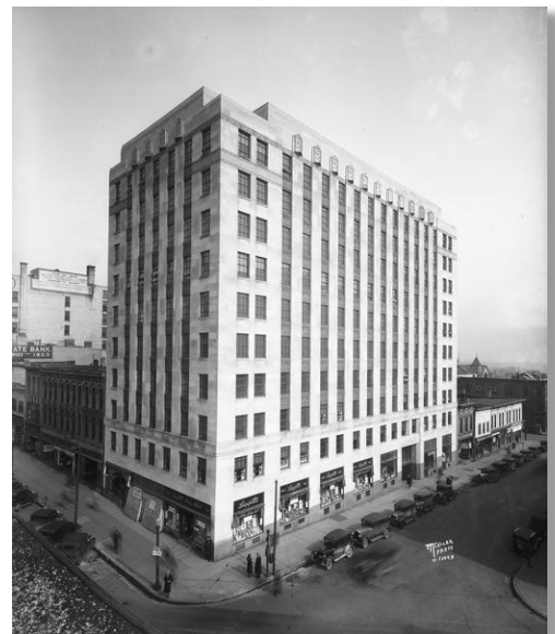
The Tenney Building, photographed in 1931, was added to the National Register of Historic Places in 2017.