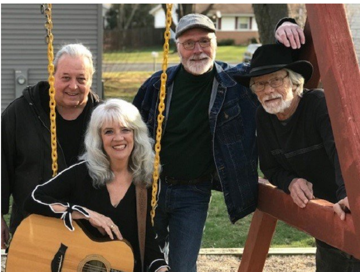
“Bad Habit” makes its first appearance at Live at the Lodge on July 27.

If you haven't paid your dues, please do so promptly. Delinquent members are not allowed to use our clubhouse or that of any other Lodge in the country. If you are dropped for nonpayment of dues, you are required to apply for reinstatement to rejoin our Lodge or transfer to any other Lodge. Delinquent members may not attend membership meetings. A reminder to everyone that all decisions made by the Lodge are proposed and approved at these membership meetings.