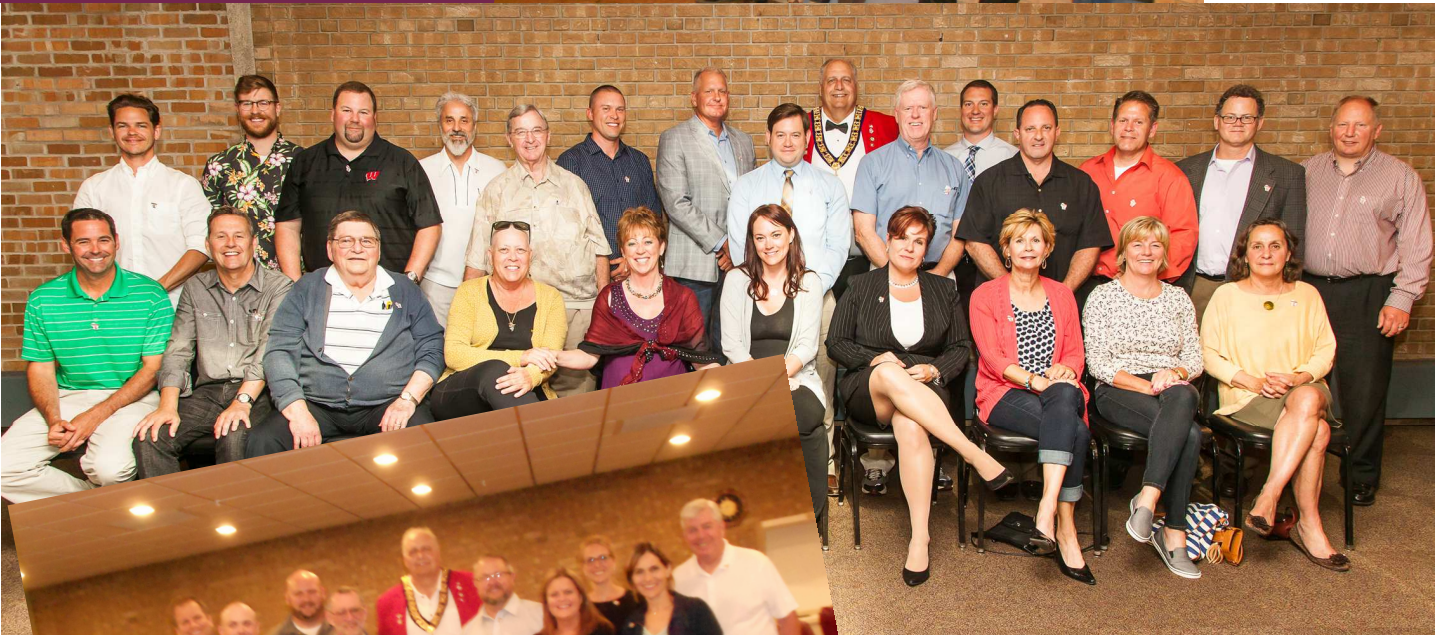
Above: May Initiation Left: September Initiation