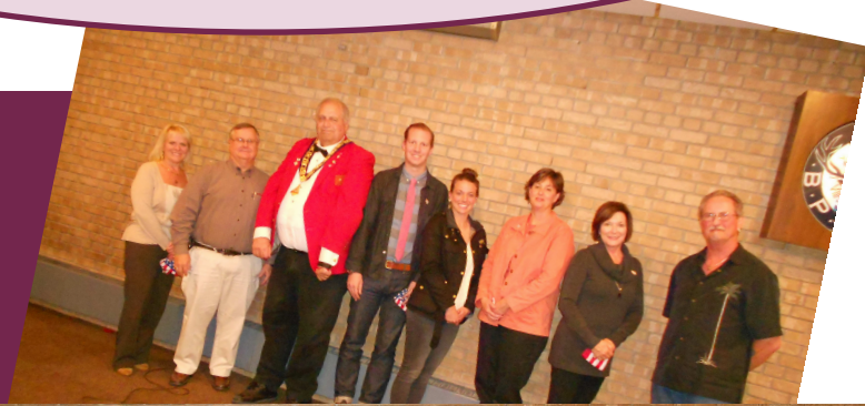
Right: August Initiation

In 2014, we inducted over 60 new members! Many of them have taken on volunteer duties large and small, further helping the Lodge. Your efforts to expand our Lodge are appreciated. Here's to another banner year in 2015!