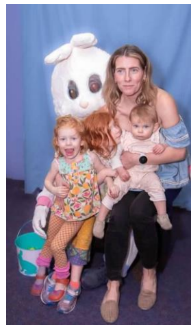
Easter Brunch was a big hit with the adults and kids alike.