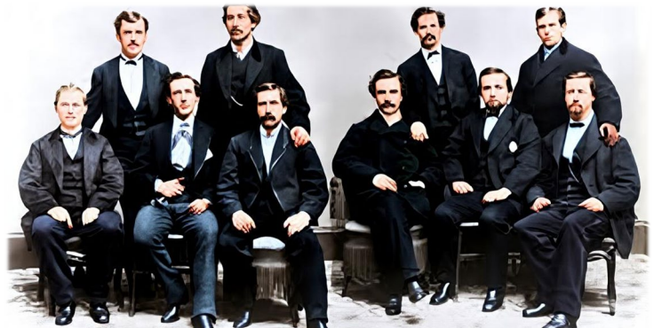
The Jolly Corks

On February 16, 1868, 15 men established the Benevolent and Protective Order of Elks and elected Vivian to head it. Its social activities and benefit performances increased the popularity of the new Order. Membership grew rapidly. Elks traveling to other cities spread the word of the Brotherhood of Elks. Soon there were requests for Elks Lodges in cities other than New York. In response to these appeals, the Elks asked the New York legislature for a charter authorizing the establishment of a Grand Lodge with the power to establish local Lodges anywhere in the United States. When the Grand Lodge charter was issued, the founders then received the first local charter as New York Lodge No. 1 on March 10, 1871.