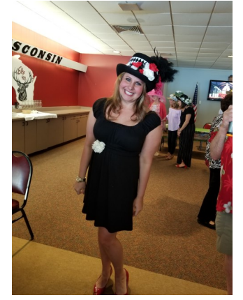
Derby Hat Contest Winner