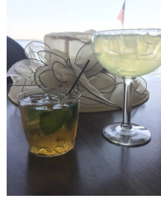
Derby de Mayo Drinks!