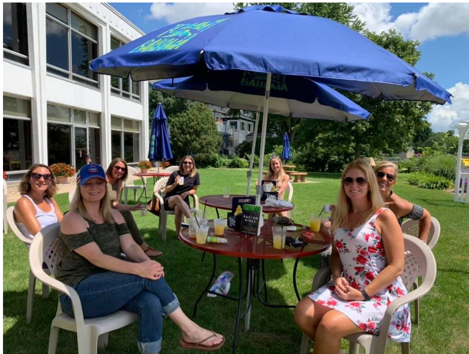
Members Enjoying Summer at the Elks on the Lakeside!

To apply for the Legacy Award, follow the same steps as above and click on “Legacy Awards.” This scholarship is also open now, but the deadline to apply is February 5, 2021