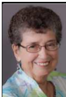
Ladies Auxiliary President

WE HOPE TO SEE YOU AND YOUR FRIENDS AT OUR ANNUAL STYLE SHOW SATURDAY, APRIL 26, 2014 See Front Cover of Elkliner For Details