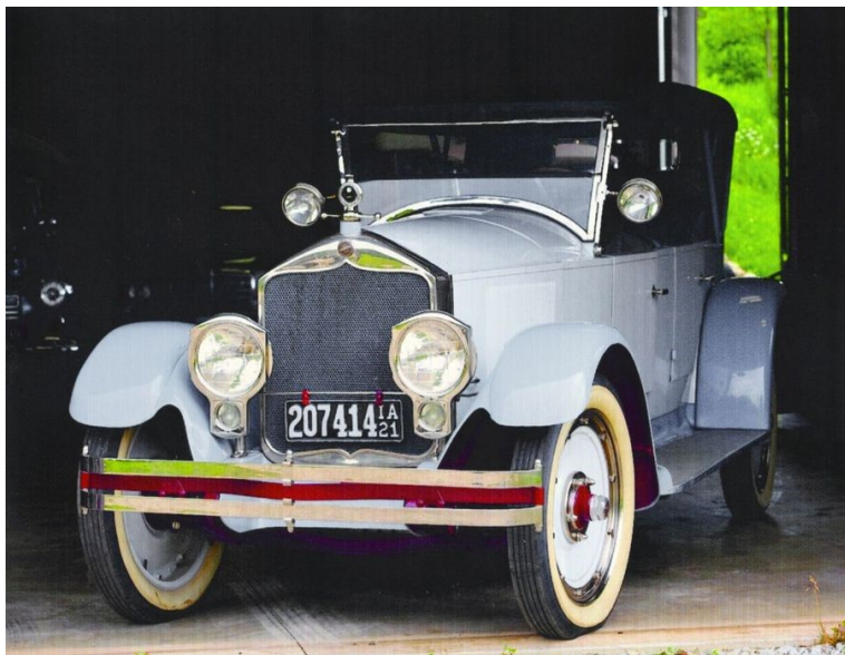
Pictured here is a 1921 National Motor Company Sextet sedan, similar to the one given away at the Elks Circus. The company produced high-end cars in Indianapolis between 1900 and 1924.

According to an April 10, 2021, Wisconsin State Journal article, both attendance – estimated at as many as 10,000 per day – and revenues exceeded the expectations of the Elk planners. Regardless, this one prove to be Madison's only Elks Circus.