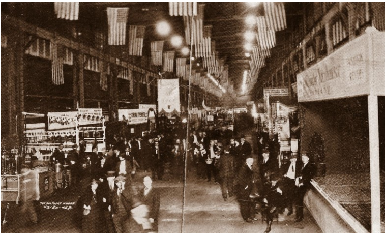
Interior of the Four Lakes Ordinance Building during the Elks Circus in 1921. Located at 2824 Atwood Avenue on Madison's eastside, the structure still stands today and is part of the Madison Kipp Corporation. When built, it was one of the largest enclosed spaces in town.