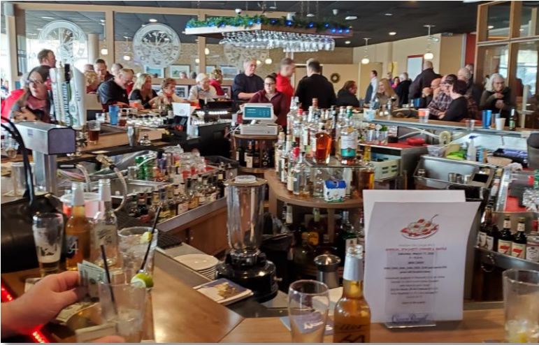
Spaghetti Dinner 2022